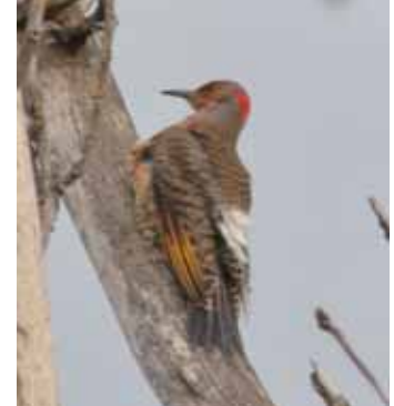
Mountain Bluebird and Yellow-shafted Flicker